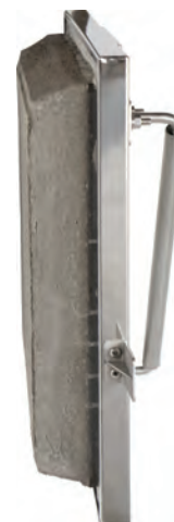
Airtight refractory cement insulated door